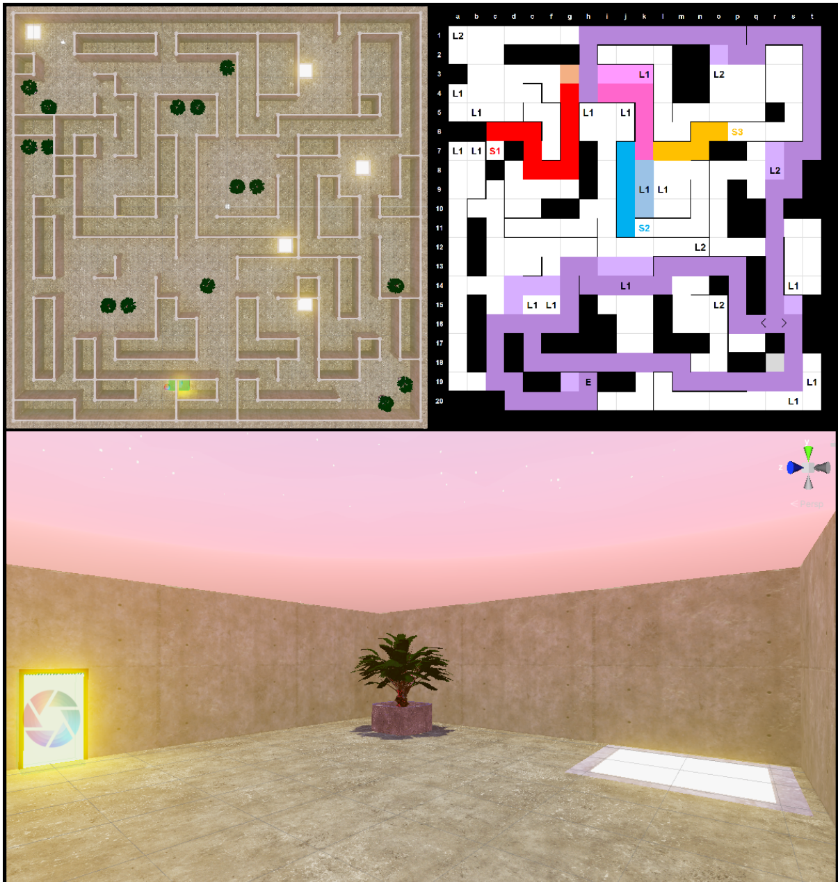
Figure 1. Virtual Maze Task. Top left: layout (top-view) of the rendered 3D maze (participants were not shown this image). Top right: 20x20 grid layout of the VMT (L1: palm tree; L2: floor light; S1-3: starting points; E: exit). The optimal paths are represented as colored grids, and include paths starting from S1 (red), S2 (blue) and S3 (yellow; green when it joins S2 path) which then combine in a common path (purple). Solid grid colors represent one of the possible optimal paths, and lightly-colored grids represent possible alternative grids within an optimal path. Note the bifurcation in grid r16 that creates two equidistant alternatives to reach the exit. Bottom: in-game egocentric (first person) view of the Adaptation phase of the VMT showing the two types of landmarks (palm tree and floor light) and the exit door.